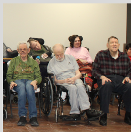
Accessing Community Experiences (ACE)