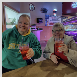
Recreation and Leisure