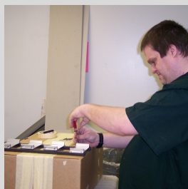
Community-Based Work Teams